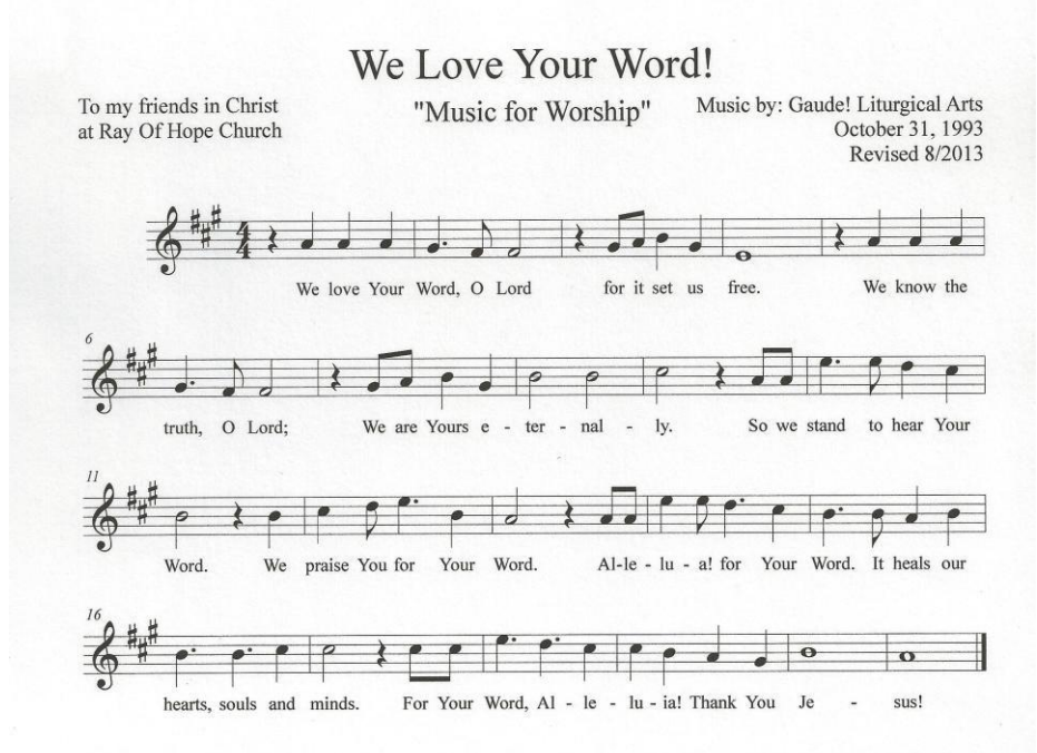
January 29. 2023 Memorial Service page: 14

©1993 by Gaude! Liturgical Arts. All Rights Reserved. International Copyright Secured. Reprinted here under CCLI#706121